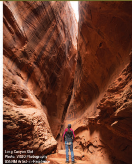
Long Canyon Slot Photo: VISIO Photography GSENM Artist-in-Residence