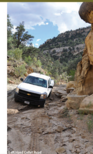
Left Hand Collet Road