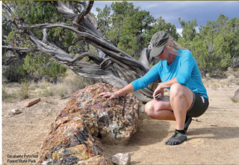
Escalante Petrified Forest State Park