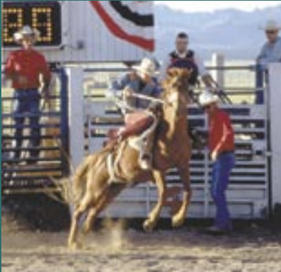
Bryce Canyon Country Rodeo