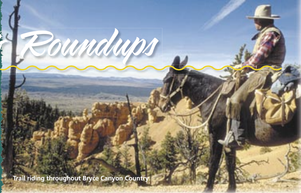
Trail riding throughout Bryce Canyon Country

Utah Trails Phone: 1-800-444-6689 Website: www.utah-trails.com